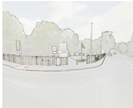
1a Sutton Road / Stourport Road entrance