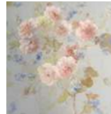
Brinton carpet floral pattern precedent