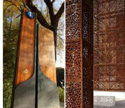
Monolith signage precedent