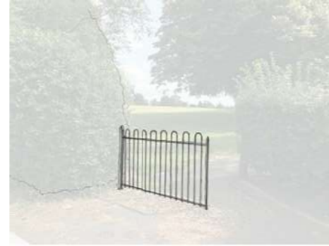
1e Talbot Street (western entrance)