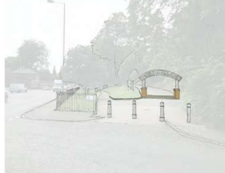
1b Stourport Road / Park Lane entrance