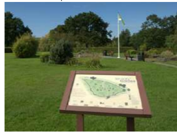
Information board precedent