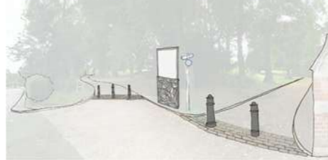
1c Talbot Street / Park Lane entrance