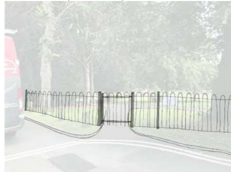
1d Talbot Street (eastern entrance)